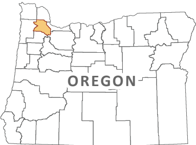
Study Location Map

Disclaimer: This product is for informational purposes and may not have been prepared for or be suitable for legal, engineering, or surveying purposes. Users of this information should review or consult the primary data and information sources to ascertain the usability of the information. This publication cannot substitute for site-specific investigations by qualified practitioners. Site-specific data may give results that differ from the results shown in the publication. See the accompanying text report for more details on the limitations of the methods and data used to prepare this publication.